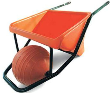
Figure 6: Dyson's Ball-barrow