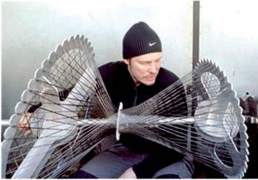
Figures 7 and 8: Spun Carbon Chair