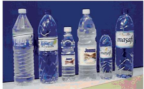
Figure 10: PET water bottles