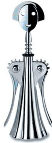
Figure 16: Alessi Anna G Corkscrew

[Source: www.alessi.co.uk ] www.alessi.com . Used with permission.