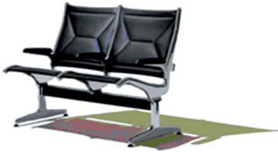
Figure 12: Tandem Sling Chair