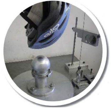
Figure 4: Evaluating protective head gear on a hemispherical anvil