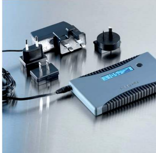
Figure 11: Minigorilla