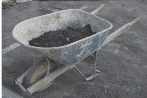
Figure 5: Traditional wheelbarrow