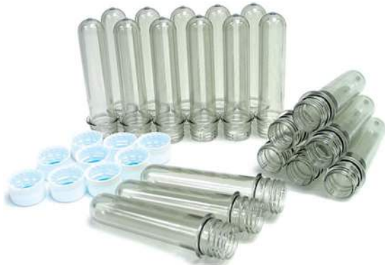
Figure 9: Standard preforms and caps