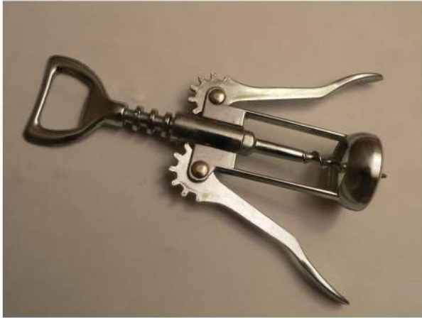
Figure 15: A double-winged lever design corkscrew

From: http://en.wikipedia.org/wiki/File:Corkscrew_P1150886.jpg Image by David Monniaux