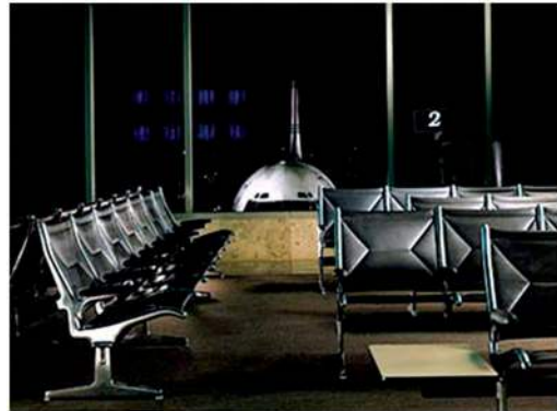
Figure 13: The chair is widely used in airports and other public access areas